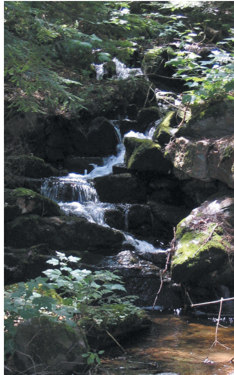
Water flowing into Buck Lake at the Helve Portage

The lakes which feed into Long Lake drain the eastern side of the Limberlost Reserve. A number of these lakes are fed not only by surface runoff, but also through underground springs. The water which flows over the falls eventually drains into the Lake of Bays.