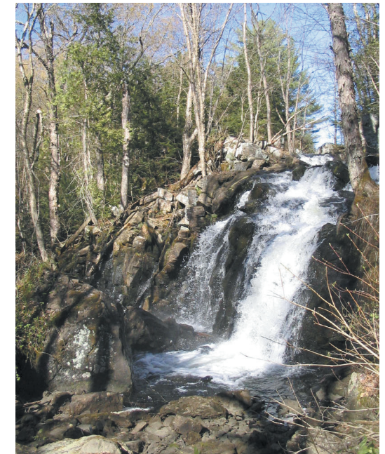
Crystal Falls at the end of Long Lake in the late spring

There are many other attractive water flows which cascade over series of rocks and ledges. None of these, however, have as large a water volume or elevation drop as the Crystal Falls or Angle Falls. These