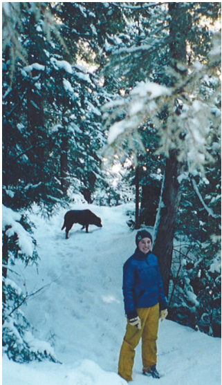
Hiking the Contour Path in winter

Link trails have been added to provide visitors with opportunities to customize the length of each outing. By joining the major trails with link trails and woodland roads, hikers can extend their hikes, assured that they can circle back to their starting point.